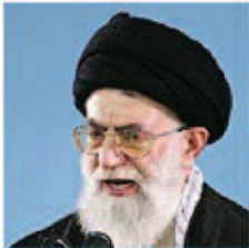
Iranian Supreme Leader Khamenei