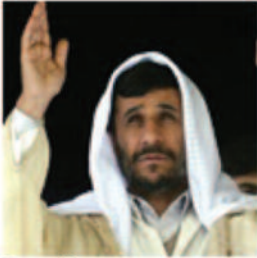
President Ahmadinejad